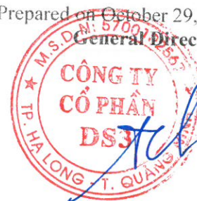
Dao Vu Chinh